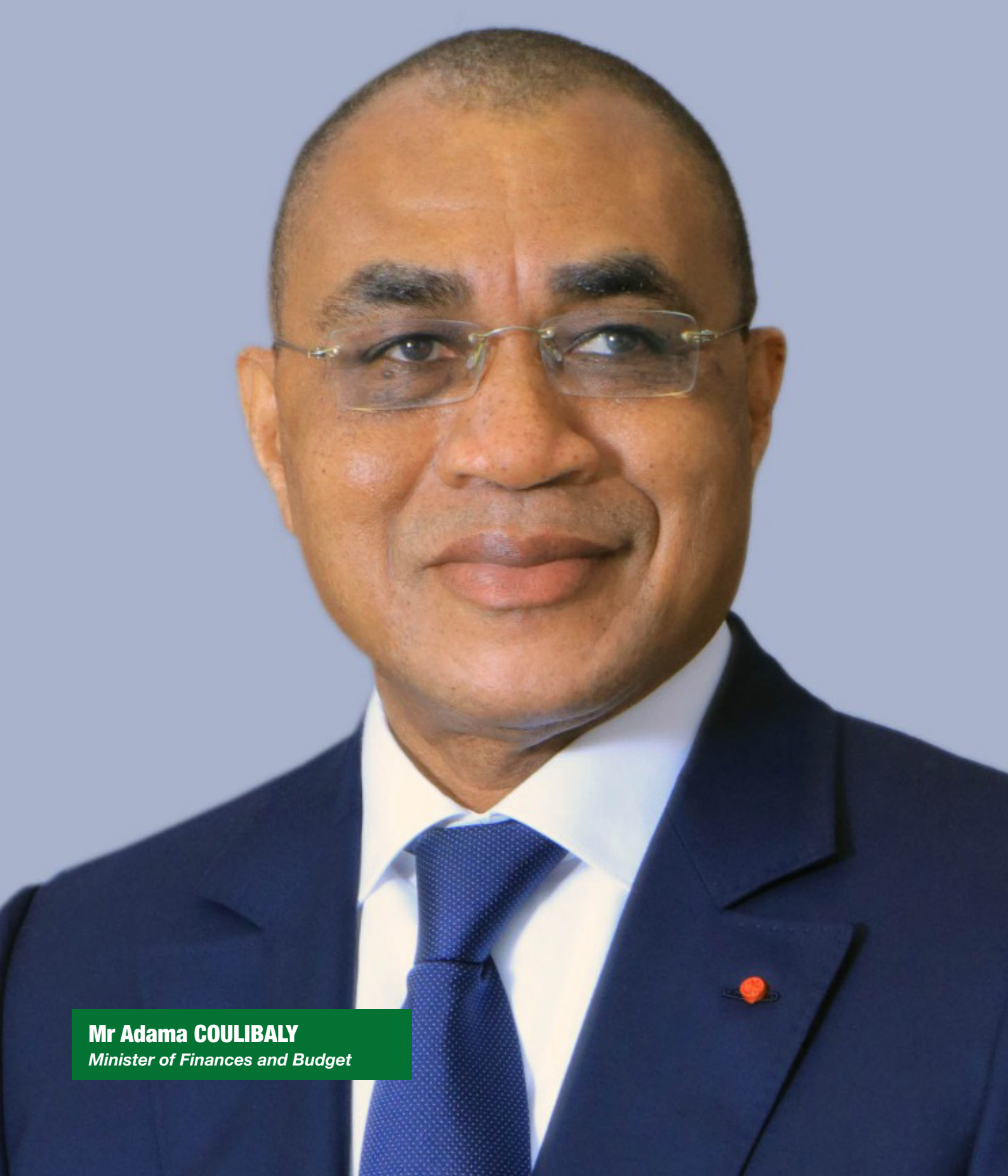
Mr Adama COULIBALY Minister of Finances and Budget