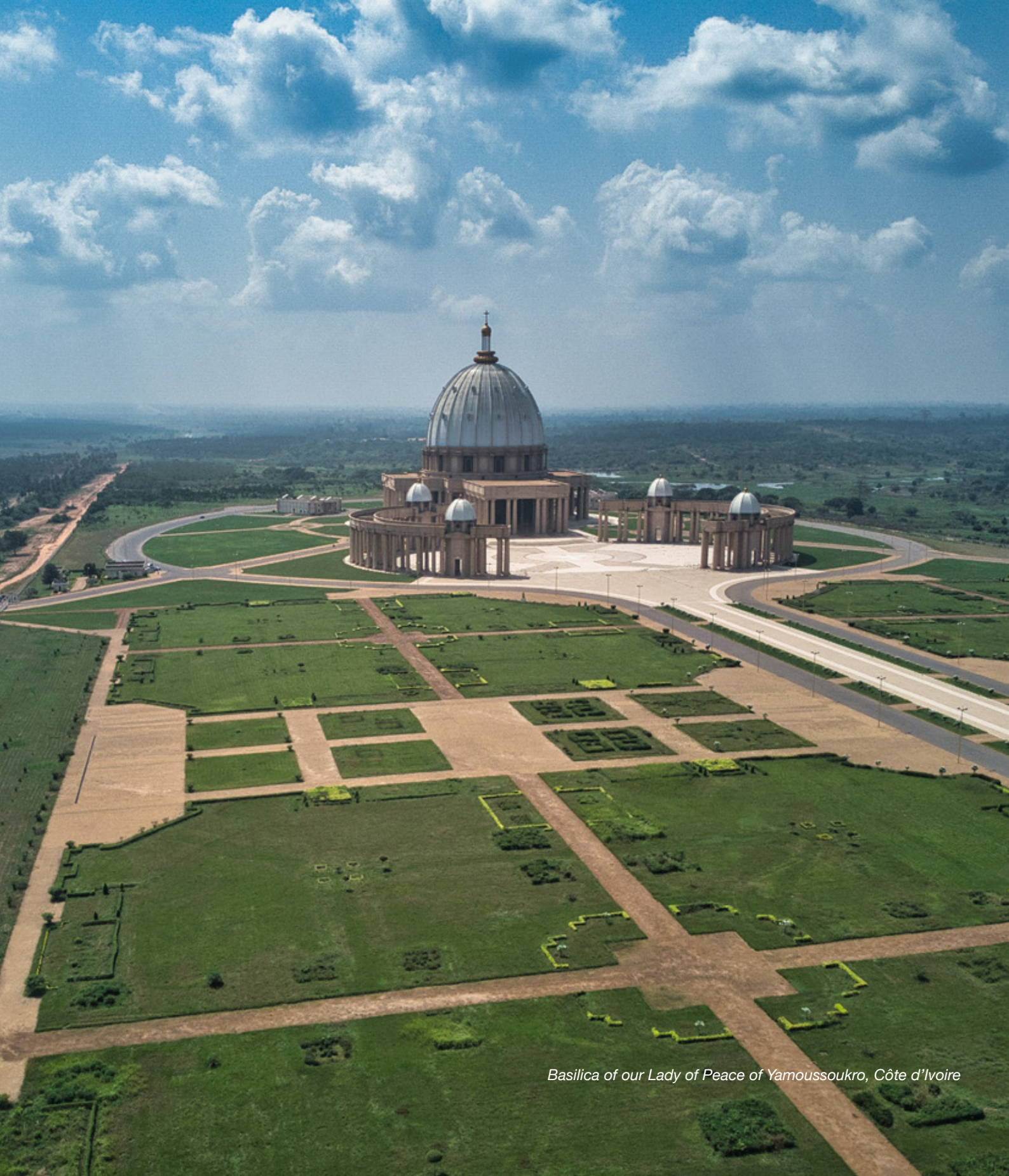
Basilica of our Lady of Peace of Yamoussoukro, Côte d'Ivoire