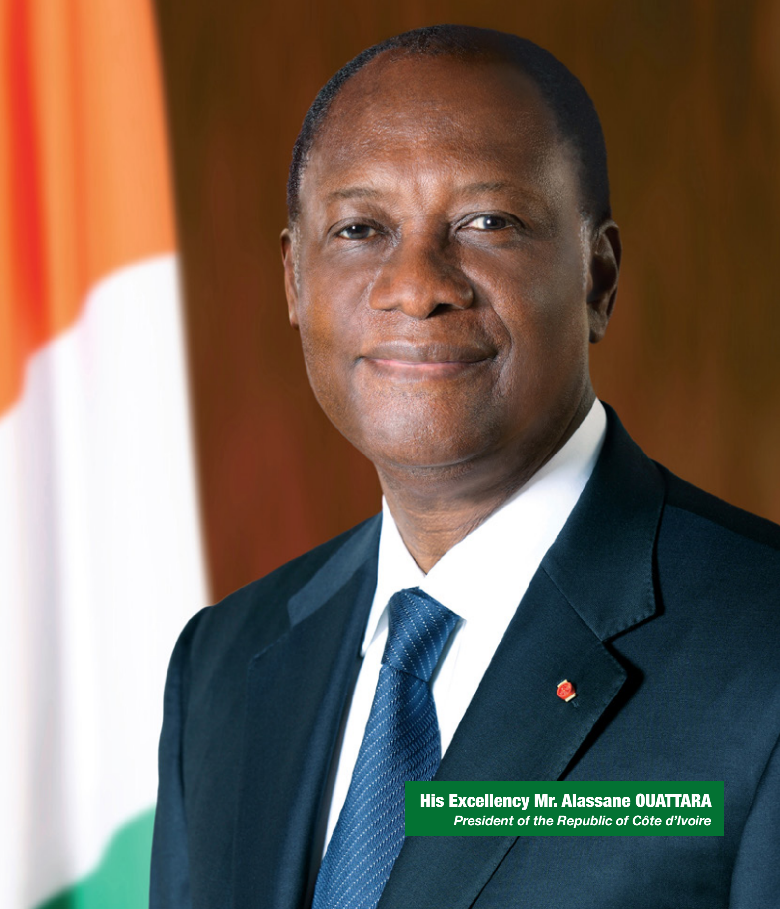
His Excellency Mr. Alassane OUATTARA President of the Republic of Côte d'Ivoire