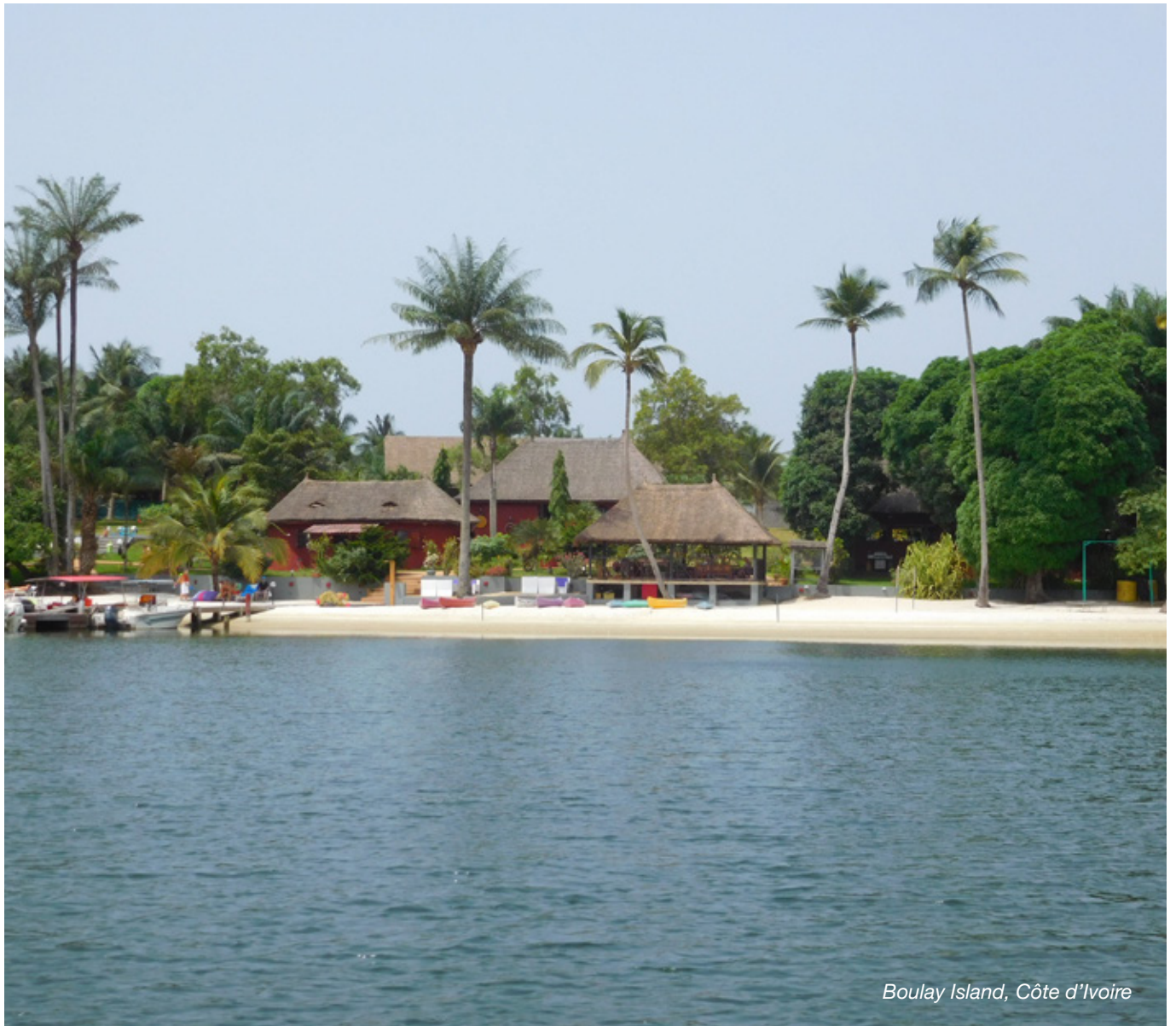
Boulay Island, Côte d'Ivoire